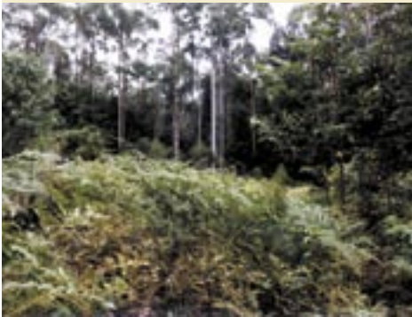
The original clearing

Termeil Guesthouse was restricted to an existing clearing which had overgrown with non-native species.