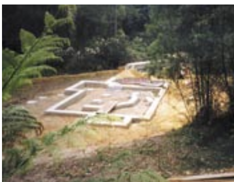
Footings and sediment controls