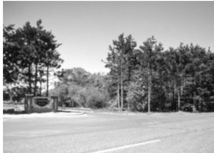
The developer protected the trees along the perimeter of Windsor Park to protect viewsheds from Elk Lake Road.

Oak woodland preserved in central park; prairie grasses in meadow