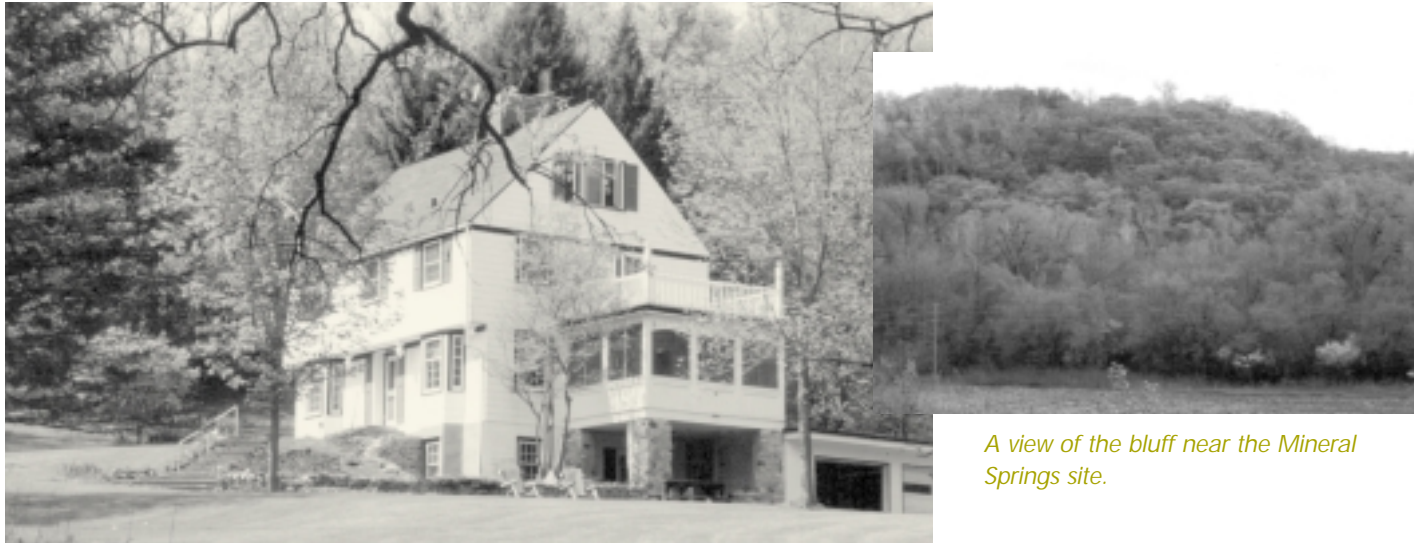
The Mineral Springs Sanatorium once occupied this bucolic site. The administrator's house is preserved as one of the private lots and is the last reminder of a bygone era.

The development of the historic Mineral Springs Sanitarium property was controversial. The former TB sanatorium, which was later used as an adolescent treatment center, was vacated in the late 1980s. Harry Jensen of J Consulting and Development purchased the 4-story hospital and the adjacent farm, intending to convert the old hospital into housing for the homeless and build some additional houses. Since the hospital had been empty for at least a year, however, the conditional use permit expired and the zoning reverted to the Wild and Scenic River zoning, requiring lots at least four acres in size with 1000-foot spacing between the homes. The rules would have permitted eight houses on the site.