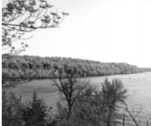
A view of the bluffs along the St. Croix River near the city of Marine on St. Croix.

The design of Jackson Meadow began in the mid 1990s, with the ground-breaking ceremony for the community held in October 1998. The Jackson Meadow design team worked diligently with citizen groups, the Marine Planning Commission, and the City Council to design the most appropriate development for this unique site and historic community. Through this process, the city – historically resistant to new development proposals – was encouraged to rewrite its ordinances to achieve greater performance from future developments.